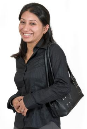
Figure 33 - What are your career goals?

This is a 5-10 year view of where you see yourself. Split the answer into two parts. What would you like to achieve for yourself and also for the company. Just be honest and give a clear answer of your personal ambitions. You need to be realistic in what you can achieve in terms of promotion, many graduates come out of university thinking they can be a manager within a couple of years, which is not likely, even when they have studied management related subjects.