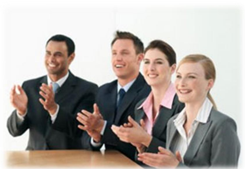
Figure 46 - How would you feel if you got offered this job?

are thinking of offering you the role but are still unsure. Still keep talking positively.