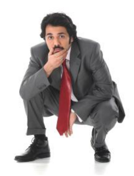
Figure 18 What did you like most and least about your last job?