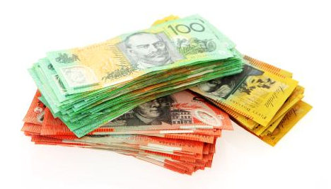
Figure 15 - How did you minimise expenses in your last role?

If your role was to make cost savings then state them explicitly. If they exceeded the targeted savings then state this too. Explain how you made the costs savings and over what period of time these happened. The employer wants to know you have the potential to save them money, because you will be just as conscientious and able to take the initiative. By demonstrating these very tangible achievements you are in a much stronger position.