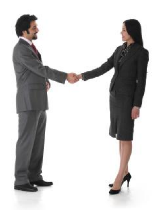
Figure 55 - Visualise the perfect interview happening in your mind

Then take this journey and exaggerate it further. Increase the size of the smiles. The warm glow the feeling of puffed up pride. Imagine yourself to be the person you would like to be. Someone who is self-assured, talented, answering questions with ease, giving model answers. Ideally these visualisations should be done while you are sitting comfortably with your eyes shut.