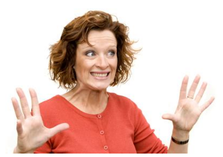
Figure 36 - Some Questions will be very tricky

Sometimes you will experience an interviewer who is new to the job, and they will ask vague questions that could leave you feeling confused about what the relevance is. The best way to deal with these types of questions is to simply state that you are not sure what they are wanting to know.