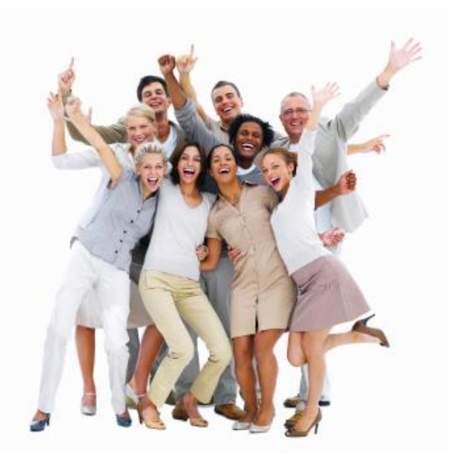
Figure 2 – Create Better Credibility in Your Answers - Suggest what your team and manager would say about you

This is one of the easiest ways to help validate what you that you possess all the attributes.