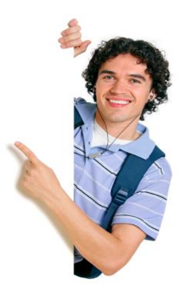
Figure 32 - Why were your grades low?

Did you help a cause, were you a member of a group or organise something outside of your curricular activities? If you didn't volunteer for anything, explain how your schedule was full to capacity with part time work and study commitments.