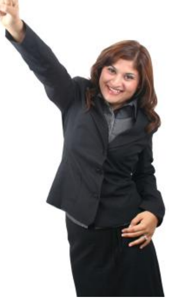
Figure 4 - Why should we hire you?

You will add significant impact if you have a relevant example which you can offer to expand on. You should end your answer with a statement such as 'do you think these qualities are what you are looking for from a successful candidate?'