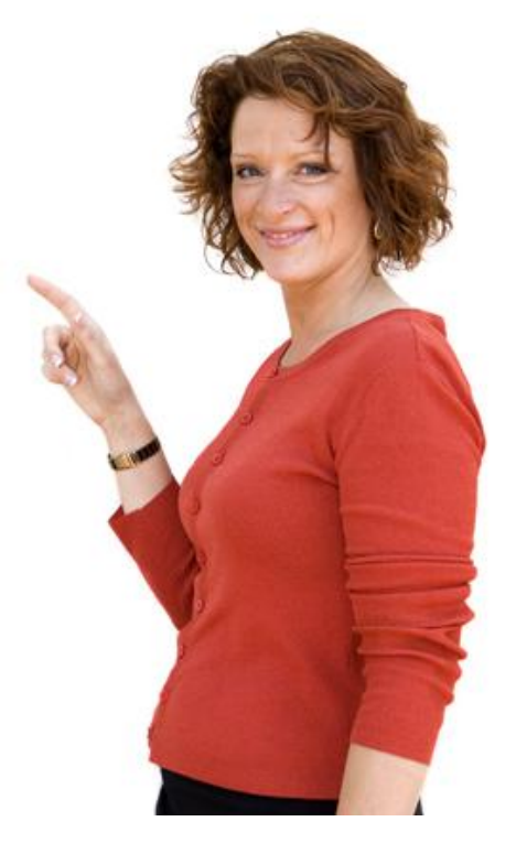
Figure 54 - A calm mind and deep breathing are essential to controlling nerves

Combine this with thinking of a peaceful image perhaps a quiet beach or a place in the countryside. Or imagine yourself soaring quietly like a bird. It will take your mind off of the interview. These types of relaxation exercises are very effective for reducing your heartbeat and reducing nerves.