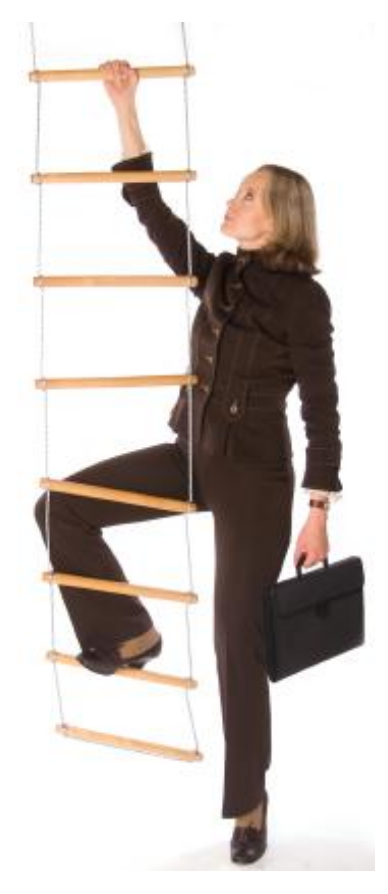
Figure 47 - Are you planning on having children?

Need to tread a bit more carefully. You would not be human if you didn't get angry inside. Play down the