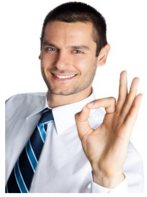
Figure 53 - Complete the Activities in this Guide

These weaknesses generally fall into two categories. Firstly there is the weaknesses in your resume or career history. If you lack experience or have had gaps in your employment then you need to be able to answer these questions. There is no point in entering an interview just hoping that these will not be addressed. You will spend so much energy fretting on this that you will harm your