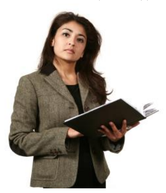
Figure 29 Tell me about a stressful situation

Your answer will be in two parts. Firstly you have learnt to avoid as many stressful situations as