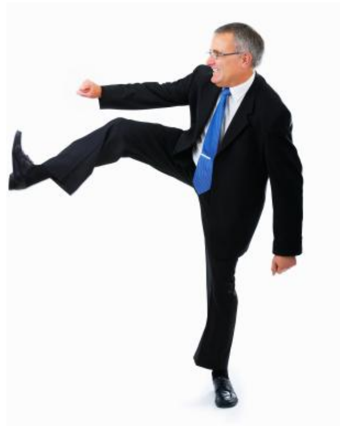
Figure 40 - Are Your Best Years Behind You?

Of course they aren't.....errrr but don't say it like that! 'I am very pleased with the past achievement in my career and in particular (list them). However I view every day as a new challenge and in particular this opportunity would allow me to achieve greater heights. I believe my experience stands me in good stead for future challenges"