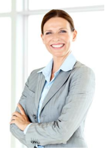
Figure 27 - What has been the most innovative idea you have presented at work?

"On many occasions, I have taken the initial enquiries about our products and services. Throughout the 2 years I had been serving prospective customers, and fulfilling their order, I noticed that many were asking for additional 'add - on' services that we did not provide. I spoke to my manager about this, and suggested that what they customer was asking for would be a simply product to produce, and once it had been created, we could sell it over and over again. I explained that there was a significant demand, and that I knew it would be worth investing the time in to create the product. He approved of the idea, and asked me to project manage the production of the new product, according to the