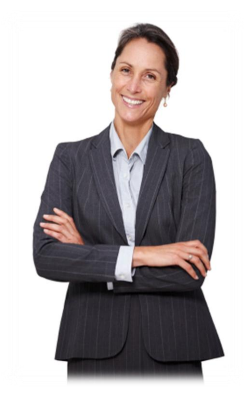
Figure 20 What personal attributes will you bring to the role?

If they reply that they were expecting other qualities then discuss them and offer examples of how you have these and examples of these in action. You need to leave the interviewer in no doubt you have the skills and can demonstrate this with examples.