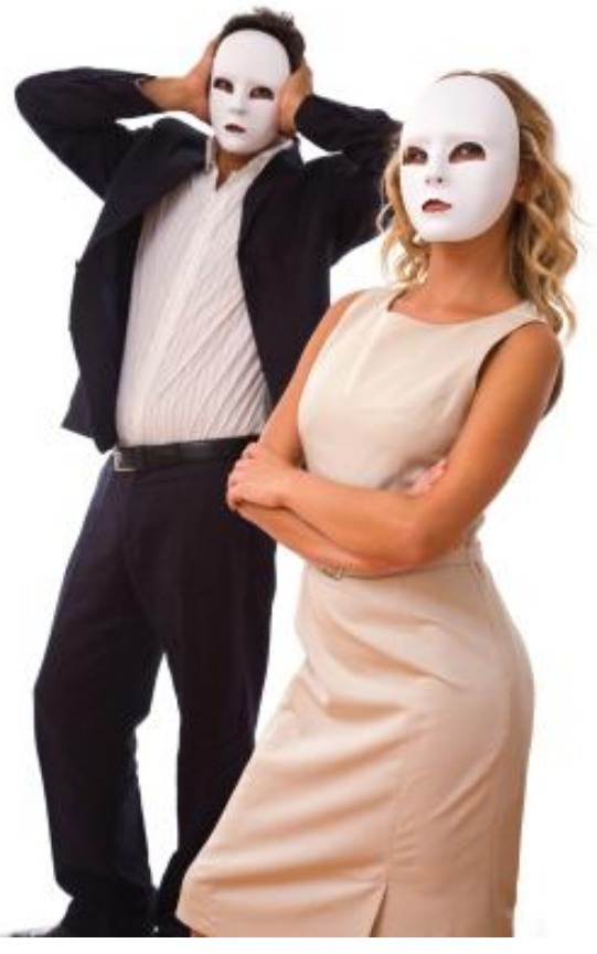
Figure 39 - Candidate x and y have these skills, do you think you can match their performance?

'I cannot comment on the other candidates and their abilities. All I know is that I have these qualities both job related and behavioural (then list them with examples).'