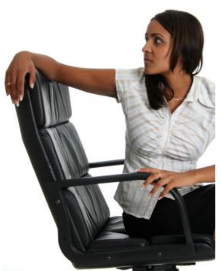
Figure 17 - Will Your Masters degree make you overqualified?

'I applied for this position because I believe it will be a great long-term opportunity for me to gain good experience and I see myself making a strong contribution to the organisation. The fact that I appear to be over qualified will mean I can bring a high level of knowledge and aptitude to apply to the job. I won't get bored and be looking for a better position. I see this role as a good fit for my skills and ambitions.'