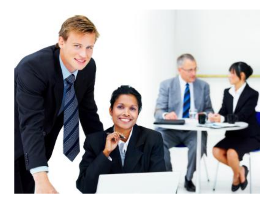
Figure 10 - do you prefer a structured enviornment?

A mixture of the two is probably healthy for any organisation and is the way I have worked in my previous roles."