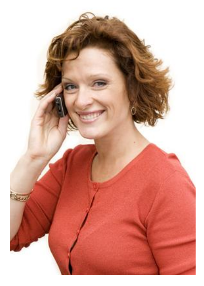
Figure 8 - What would you references say about you?

Any time you are able to reply in the third party it sounds like someone else is endorsing your candidacy which in effect references do. Everyone will say they will receive good references but if you say this using a third party then you add greater credibility to your statement.