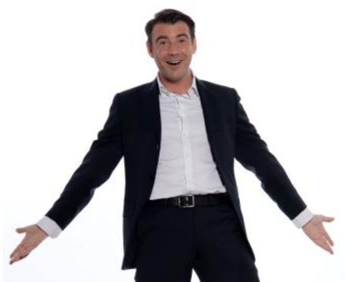
Figure 9 - What could you have done better in your last job?

Go on to describe your successes and try to avoid answering the question directly.