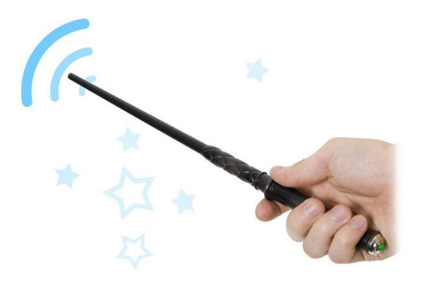
Figure 5 What tasks would you wish never to do again?

would like to avoid any bureaucracy or red tape which can delay decisions. Like anyone I am always