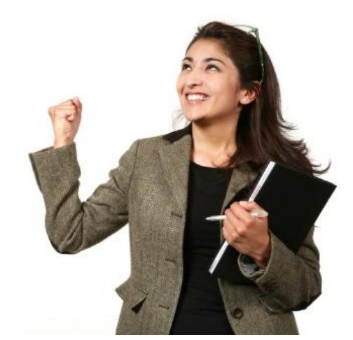
Figure 13 Would you have liked to have your supervisor's job?

"Yes, I am fortunate that I have a great supervisor where we work well together. She has asked me to be second in charge for her a number of times and I enjoyed the challenge and increased responsibility that came with it."