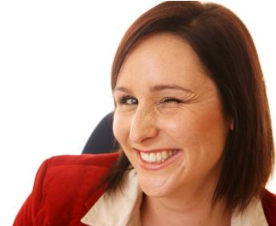
Figure 52 - You know what, after all those tricky questions, they actually offered me the job, now I am thinking "do I really want to work for a company like that?"

Try to keep the reply upbeat by saying you are thrilled to be considered for such an exciting position which is a great opportunity to advance your career.