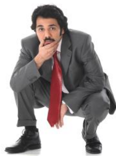
"Fortunately throughout my career I have had a continued upward progression in my performance to the point today

Obviously you want to say no here. If the person asking the question does not know whether you met your targets then you can sidestep any failings. Keep the answer general if you have had a rocky period when your performance wasn't as good. Always end your answer on a positive note giving yourself another chance to shine.