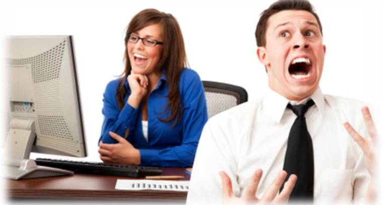
Figure 31 Do you work well under pressure?

"We have a new chief executive and he raised the sales targets by 50%. This is a very aggressive increase but we met the target despite being under pressure." You can see how telling the story and putting into a context will allow you to demonstrate this competence. '