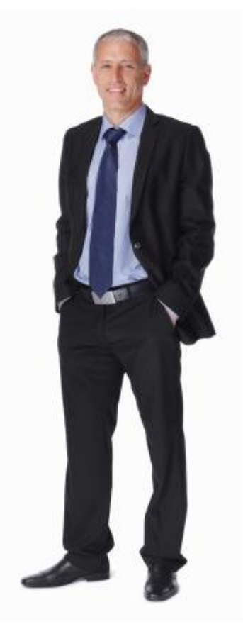
Figure 5 - Why are you looking to leave your current role?

You would then confidently say that you feel like you can do the job, and offer a different set of skills and experience to someone who has only ever done this type of work before.