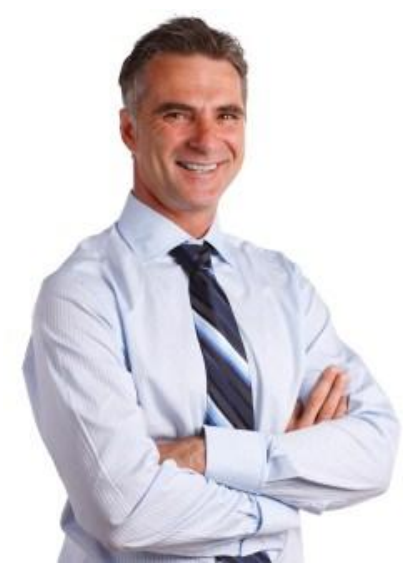
Figure 38 - What if another candidate had better skills than you?