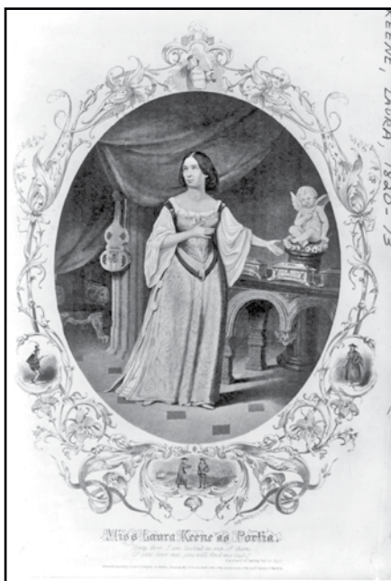
British actress Laura Keene (1826–1873) played Portia in The Merchant of Venice .

a figure as those two characters, but there is nonetheless a sense that he stands for more than Shakespeare might have had in mind—he seems to exceed the sort of character he was meant to be.