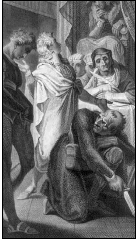
This is a scene from Shakespeare's The Merchant of Venice that features Bassanio and Shylock.

stuff of a comic villain, an almost stock character in Elizabethan drama—and one that Shakespeare's audience would know how to laugh at and enjoy.