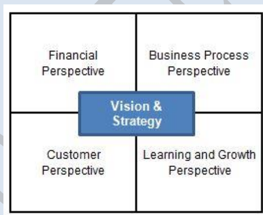
Figure 2 The balanced scorecard dimensions

Following is the simplest illustration of the concept of balanced scorecard. The four boxes represent the main areas of consideration under balanced scorecard. All four main areas of consideration are bound by the business organization's vision and strategy.