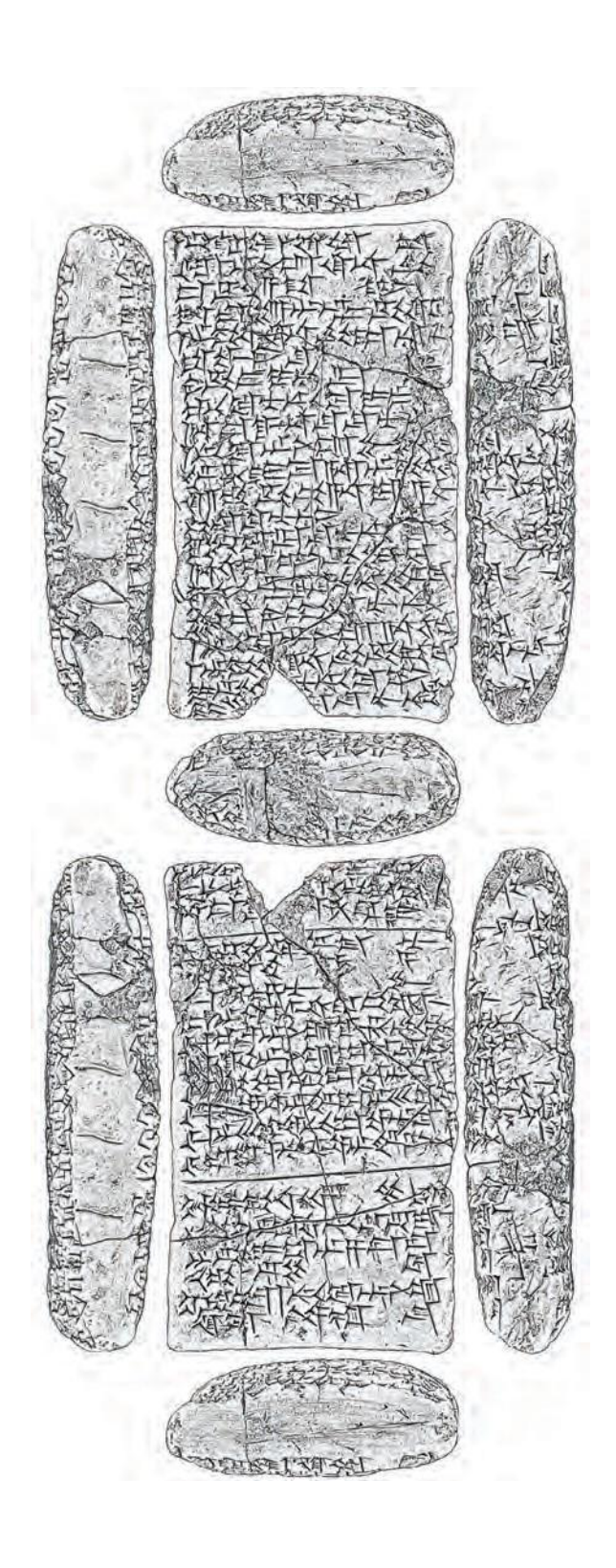
Text no. 1